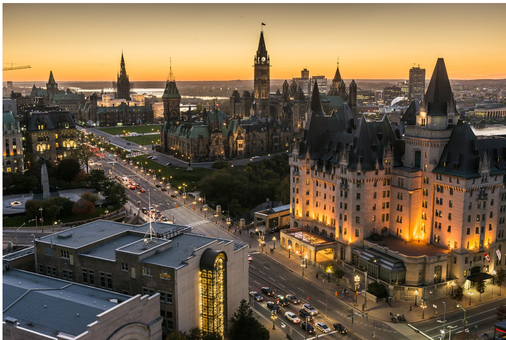
The cover of the 2015 Proceedings

Information regarding our scholarships, eligibility and the application process can be viewed on our website. Members are asked to pass this information on to students they know or meet who are studying asphalt technology at the graduate, undergraduate or college level.