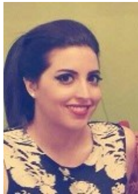
Arbia Garfa Ecole de technologie supérieure