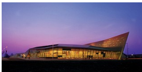
Welcome Reception will be held at the relatively new (2005) Canadian War Museum On Sunday, November 15, 2015

These forms along with a ballot and return envelope have been included with the package to those members receiving the Newsletter by post. For those members receiving the Newsletter electronically, the nominee list, ballot and return envelope have been mailed to them.