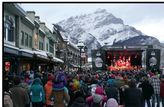
Canada's women's hockey team takes the stage at Saturday's Block Party Olympian send-off party in downtown Banff. (2014)

The Local Arrangements Committee for Banff wish to advise that a jogging and fast walking morning session will be available for people who want to get some exercise and at the same time explore Banff.