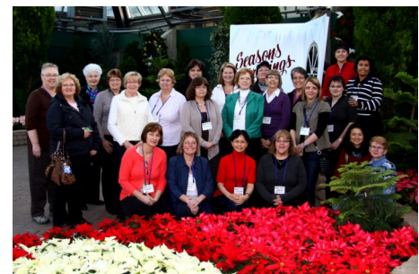
Accompanying Guest attendees