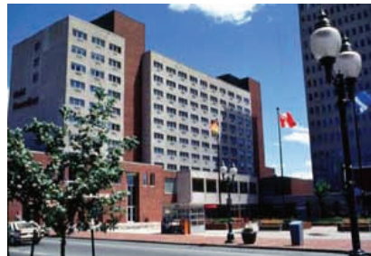
The Delta Beausejour

The 2009 Conference is being held at the Delta Beausejour, in Moncton, New Brunswick, November 14-18, 2009.