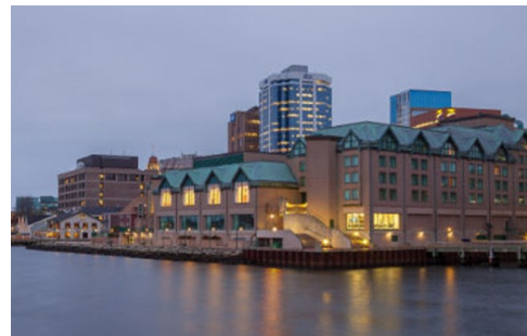
Halifax Marriott Harbourfront Hotel

The program planned for this year is expected to be as interesting and thought provoking as programs from previous years. The Canadian Technical Asphalt Association exists for these conferences and the Proceedings generated therefrom. The Local Arrangements Committee has been planning the entire program for over two years and looks forward to welcoming a large number of existing members, new members and guests. Please support your Association by attending the 2017 Conference in Halifax, NS. Check our website at www.ctaa.ca and click on Conference for conference news and updates, and be sure to check out this year's sponsors. Don't forget we have a new portal for online payments and conference registration.