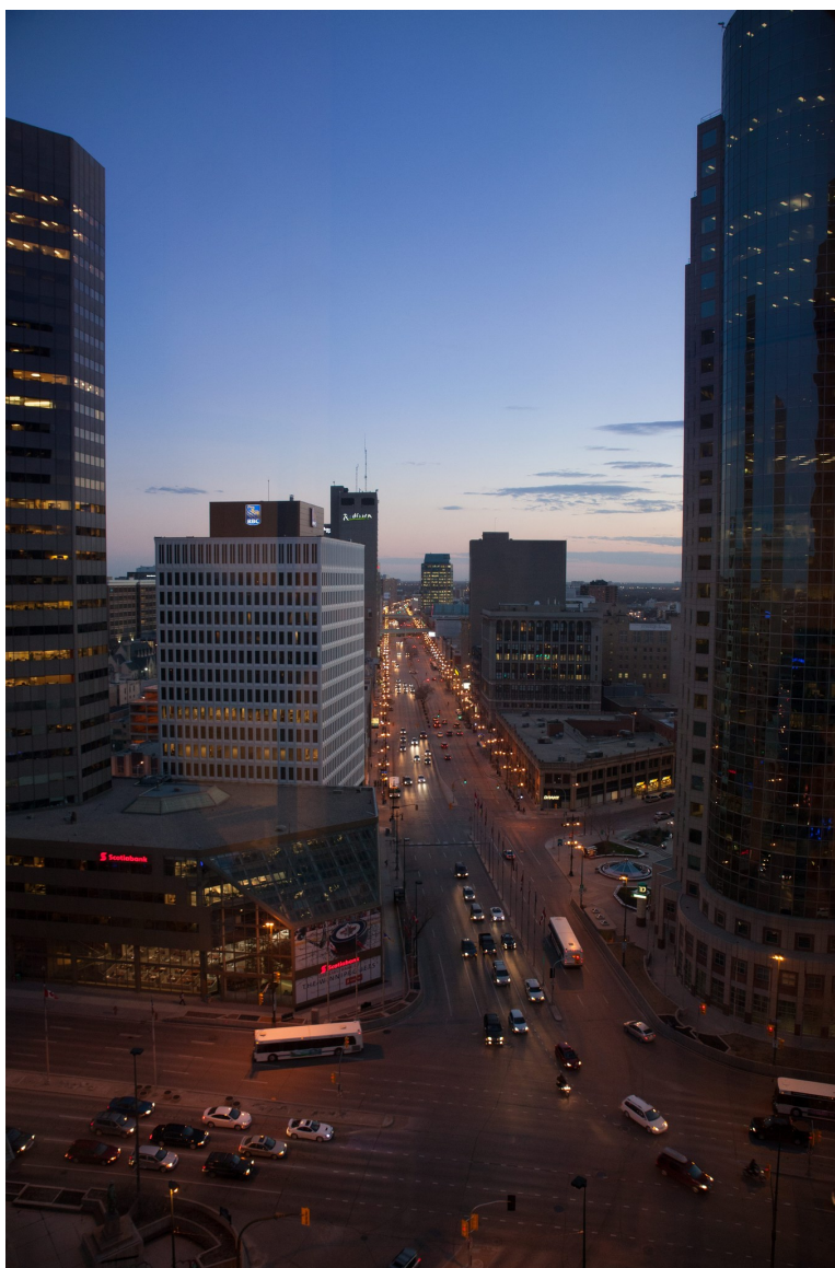
The cover for this year's Proceedings

However, if the current year's dues are paid before September 30th, delinquent members' names will be reinstated on the membership list for purposes of conference discount, they will be issued a set of Proceedings, and their names will be printed in the membership list appearing in the Conference booklet. Unfortunately, payment after July 31st does not allow for reinstated members to be included in the Proceedings membership list.