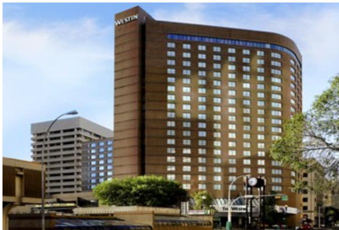
The Westin Edmonton – site of the 2010 conference.