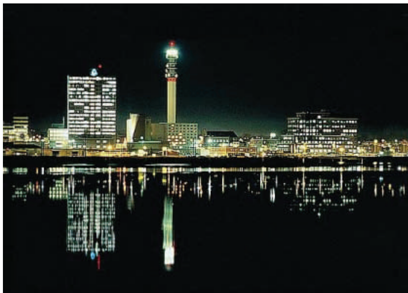
Moncton Skyline showing the Delta Beausejour

Conference Registration Fees: The business of preparing for and staging an association conference is becoming more difficult and time-consuming each year. The hotels are wanting some money up front plus fairly accurate room requirements and meal numbers. This means that the Local Arrangement Committee would like to know as early as possible who will be attending. In order to help make this work it was decided to increase the conference fee by $50 for all those who register after October 26, 2009. While the majority of conference attendees are normally registered well ahead of the conference there have been some years such as 2008 when late registrations have made room and meal arrangements quite difficult. We appreciate your understanding and hopefully this will not deter any who wish to attend the conference.